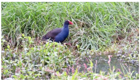
Purple Swamphen (Area D).