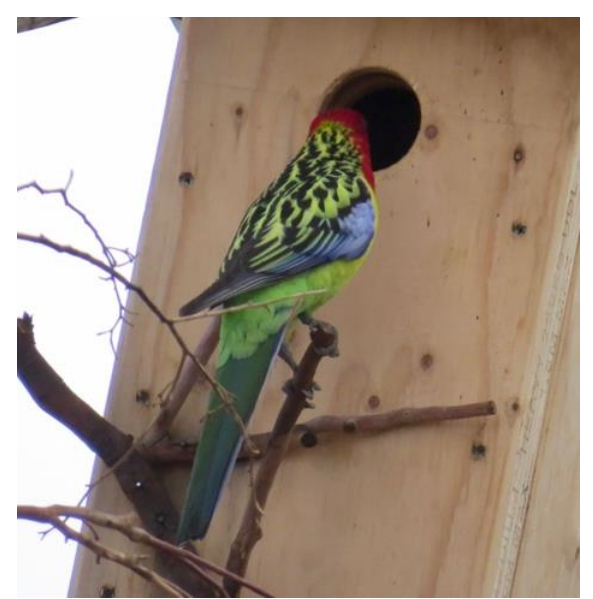
Eastern Rosella inspecting a nest box (Area F).