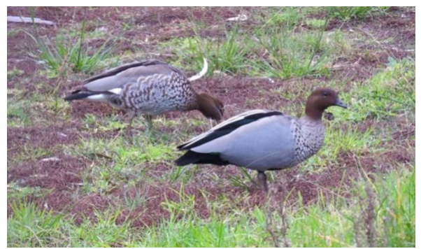
Pair of Australian Wood Ducks (Area E).