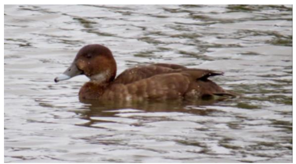
Juvenile Hardhead (Area A pond).