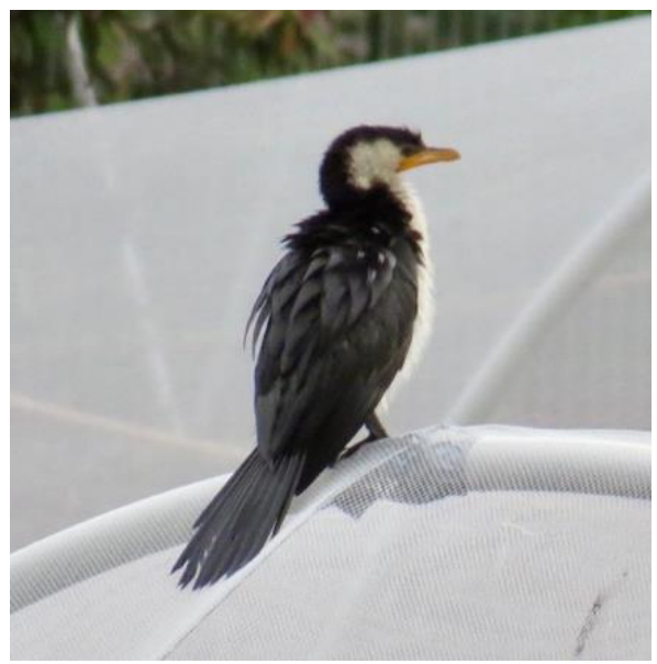
Little Pied Cormorant on netting frame (Area E).