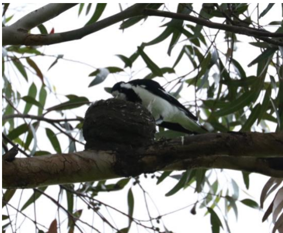
Magpie-lark tending its nest.