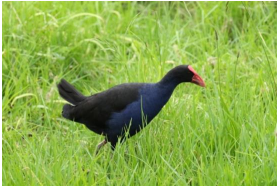
Purple Swamphen.