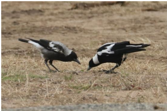
Immature Australian Magpie (left) being taught to find food by adult male.