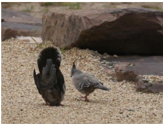
Crested Pigeons (in mating dance on the left).