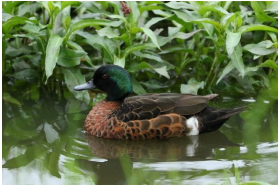
Male Chestnut Teal.