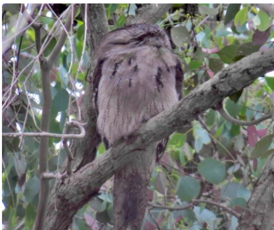
Tawny Frogmouth.

in nest hollows, either on eggs or keeping babies warm.