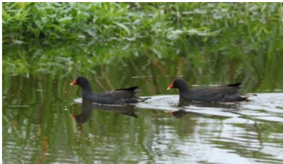
Dusky Moorhens.