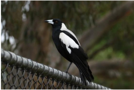
Adult Australian Magpie.