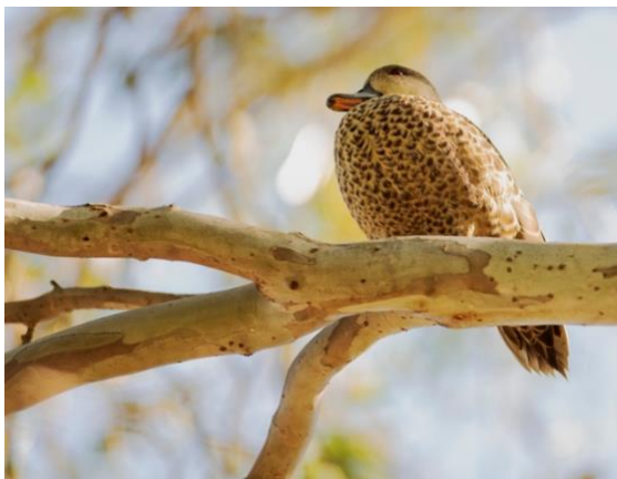
Grey Teal roosting in a tree.