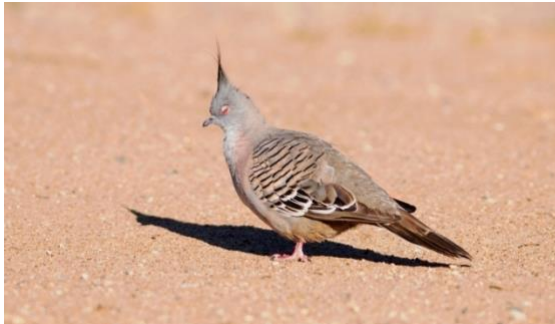
Crested Pigeon.