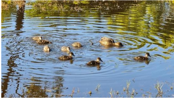
Chestnut Teal with young in the ephemeral pond.