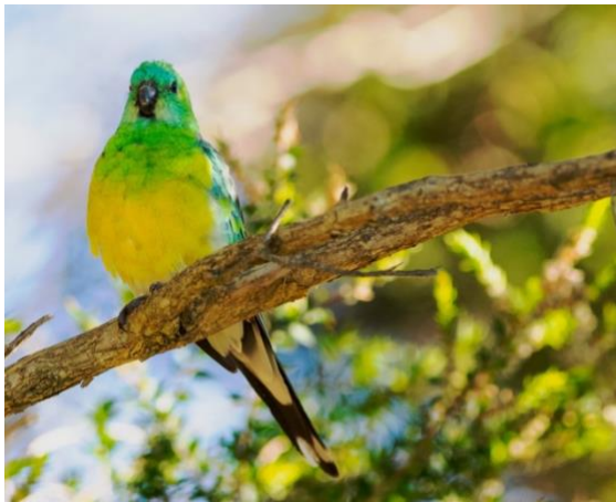
Male Red-rumped Parrot.