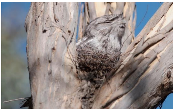
Tawny Frogmouth back on the nest with a new brood.