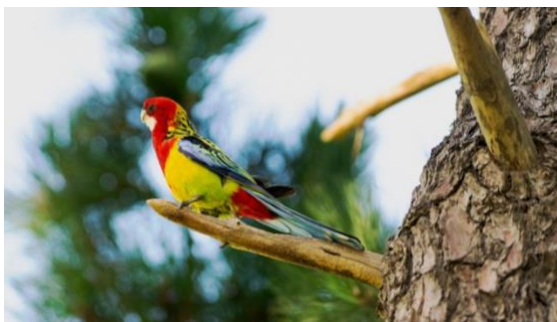
Eastern Rosella.

Our total species count was 26, comprising 9 wetland birds, 13 terrestrials, and 4 pest species. This was 2 higher than in November, but still considerably lower than our high of 32 species in September 2022.