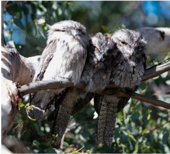
Tawny Frogmouth adult with 2 juveniles.