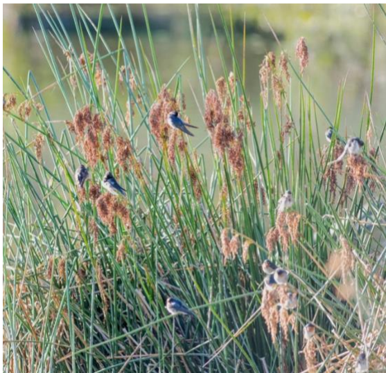
Welcome Swallows roosting on reeds around the main pond.