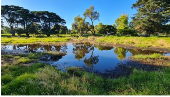
New, ephemeral pond across B and C.