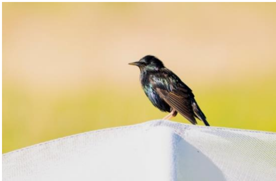
Common Starling.