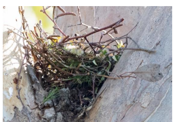
Tawny Frogmouth nest.