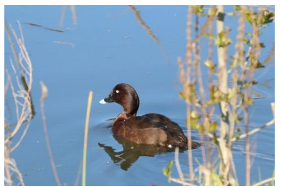
Male Hardhead.