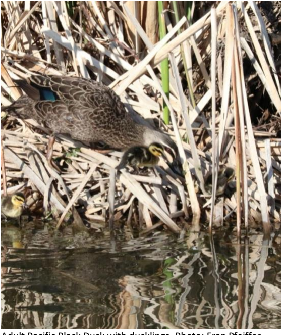
Adult Pacific Black Duck with ducklings.