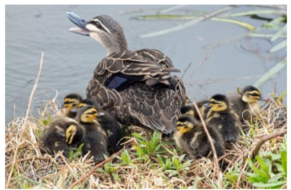
Adult Pacific Black Duck with ducklings.