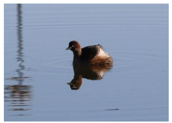
Australasian Grebe.