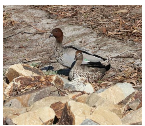
Male and female Australian Wood Ducks.