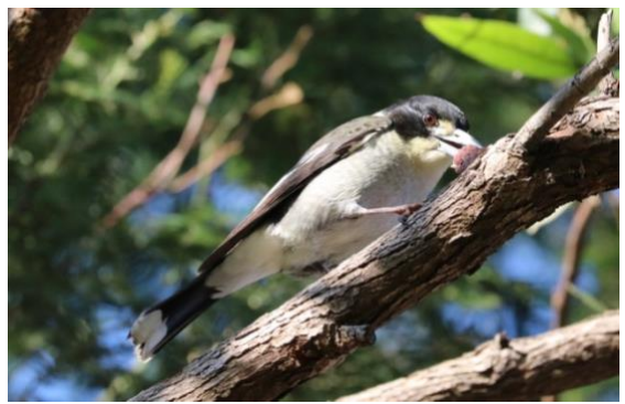
Grey Butcherbird eating mince.