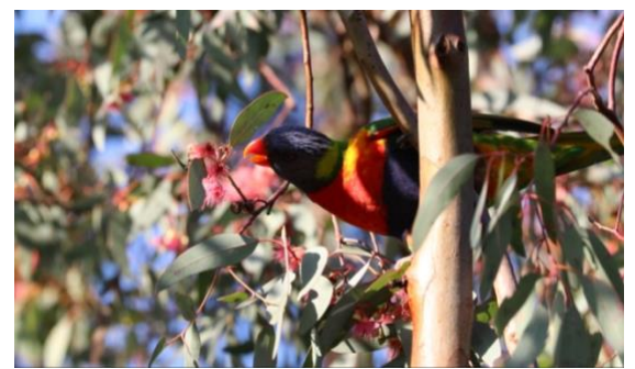
Rainbow Lorikeet