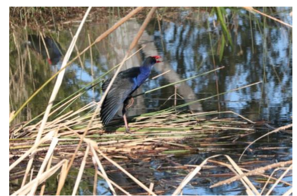
Purple Swamphen on reed platform.