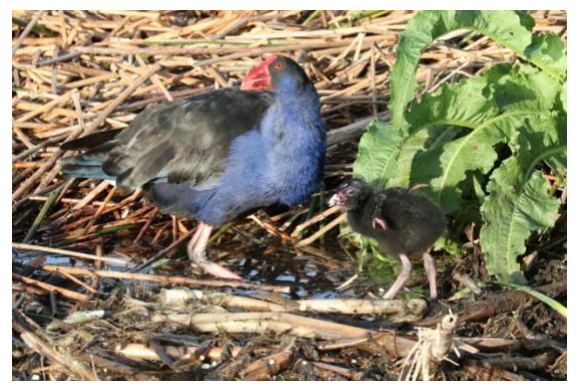
Purple Swamphen with very young juvenile.