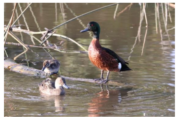
Male (right) and female (left) Chestnut Teal with duckling. Photo: