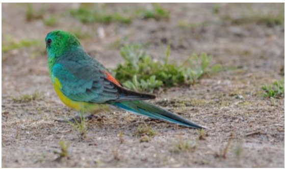
Male Red-rumped Parrot.