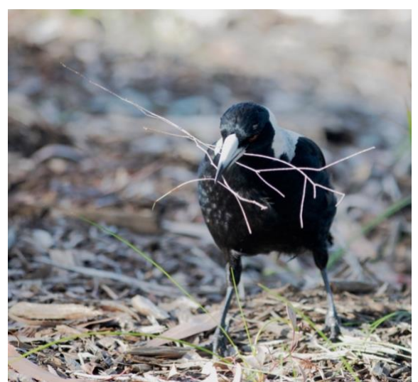
Australian Magpie gathering nest material.

adults; in F a pair of Australian Wood Ducks were leading their 5 ducklings into the Chain of Ponds. Laura observed that, compared to other ducks, Wood Ducks are particularly diligent and watchful parents; these birds were carefully controlling the movement of their offspring from all angles.