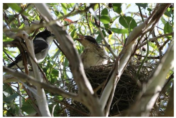
Grey Butcherbird with juvenile on nest.