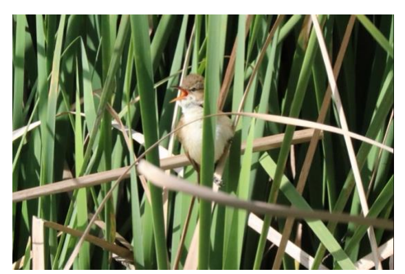
Australian Reed-Warbler.