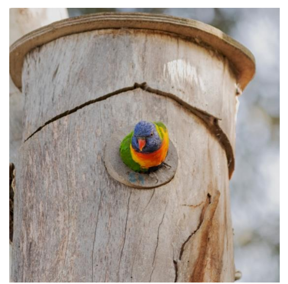
Rainbow Lorikeet in nest box.