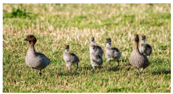
Australian Wood Ducks shepherding their brood.