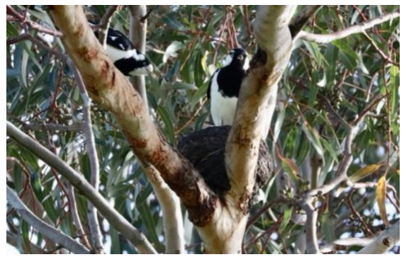
Magpie-larks guarding their nest.