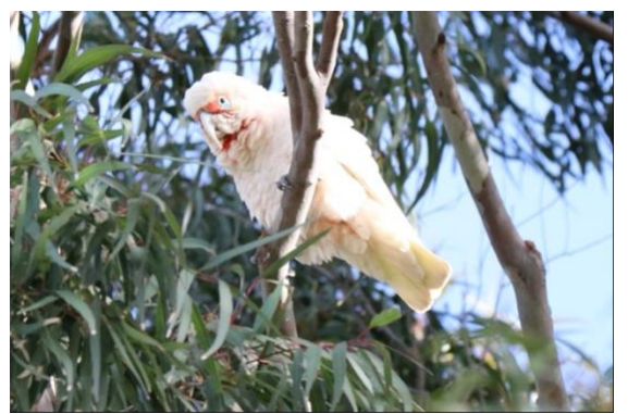
Long-billed Corella.

A single Eastern Rosella was seen in A, D, F and G, and a single Sulphur-crested Cockatoos in B and G. Single records were made for a female Hardhead and an Australasian Grebe on the original pond (A), a Red Wattlebird (F), a Pied Currawong (heard in G), a Masked Lapwing (F) and a White-faced Heron (F), which may have been a parent to 2 juveniles in a nest tree further along the canal. Out of a total of 64 birds, only one waterbird was recorded on the canal—a Chestnut Teal.