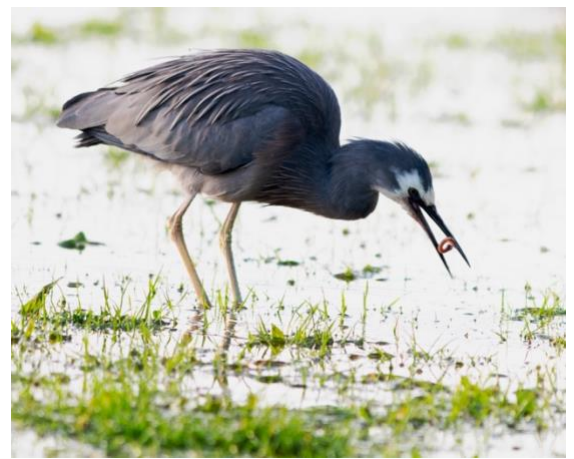
White-faced Heron.