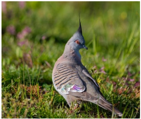
Crested Pigeon.