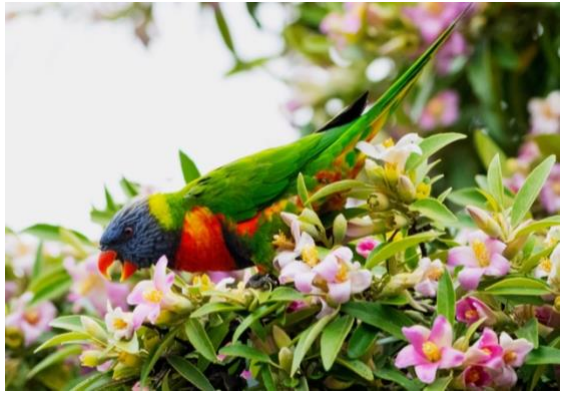
Rainbow Lorikeet on Norfolk Island Hibiscus.