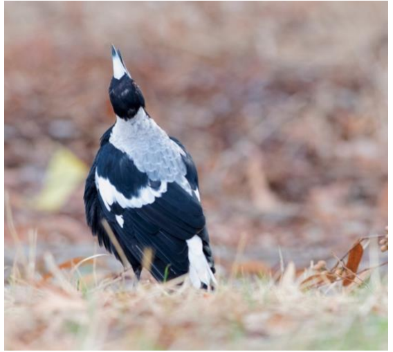
Immature Australian Magpie vocalising.