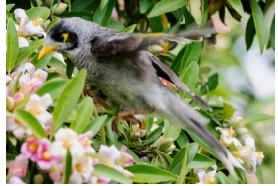
Noisy Miner on Norfolk Island Hibiscus.