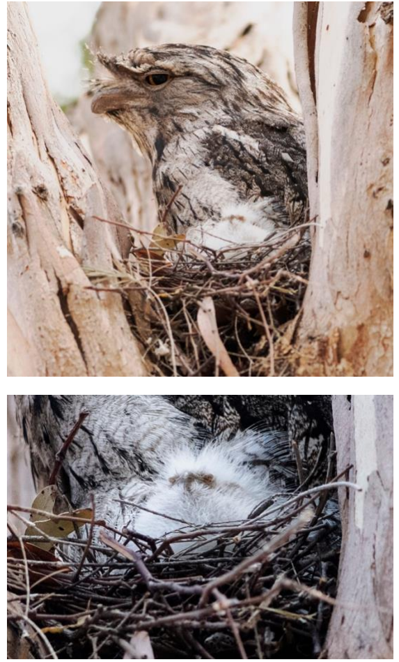
Tawny Frogmouth on nest with one new chick visible (second brood).