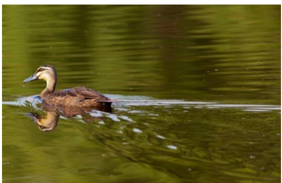
Pacific Black ducklings and adult.

and may have been an immature trying to learn the call. A flowering Norfolk Island Hibiscus attracted a large number of Musk Lorikeets and a few Rainbow Lorikeets. A Pacific Black Duck had 2 ducklings and there were 3 adult Dusky Moorhens, 3 juveniles and 2 immatures. Later, when we were passing back through Area A to get to Area G, we saw a single Grey Teal and 2 Grey Butcherbirds (one a juvenile).