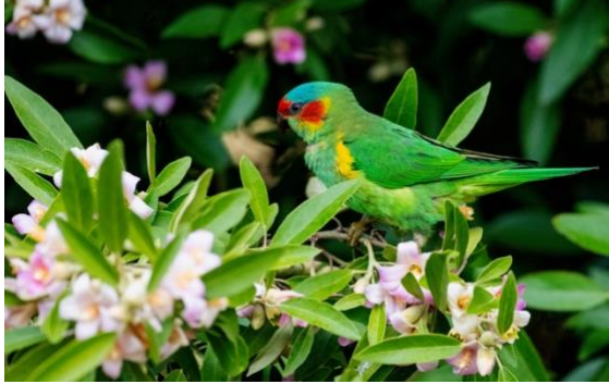
Musk Lorikeets on Norfolk Island Hibiscus.