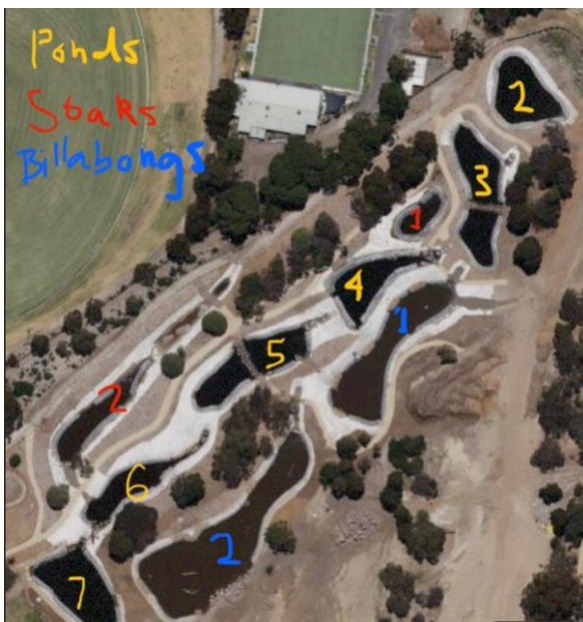
Pondage in Areas E and F (by Gio Fitzpatrick).