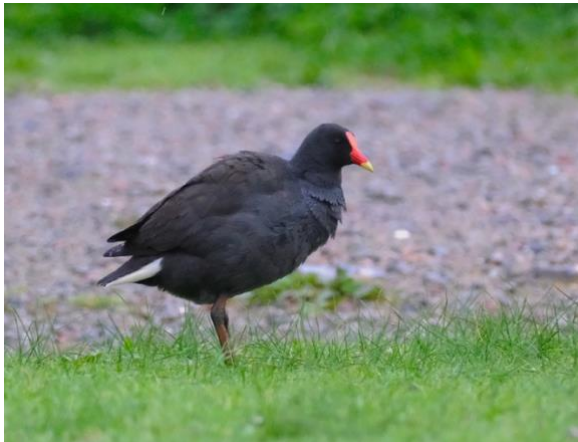
Dusky Moorhen.