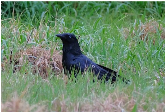
Little Raven.

Across the 7 survey areas, we recorded increased numbers of Welcome Swallows (33), Chestnut Teal (30), Eurasian Coots (29) and Grey Teal (14), but there were surprisingly few Pacific Black Ducks (3)* and Australian Wood Ducks (7). Wood Ducks were only observed in Area E, their numbers swelled by a mother duck patiently sheltering at least 3 young beneath her widespread breast and fluffed out wings (see image). Four ducklings were videoed swimming with parents on 3 and 12 September (Robyn de Havilland, Rick Hammond, YWNA Facebook entry). The full complement of wetland birds also included a single Little Pied Cormorant and a single Little Black Cormorant.