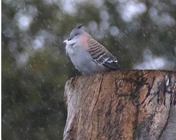
Crested Pigeon in the rain.