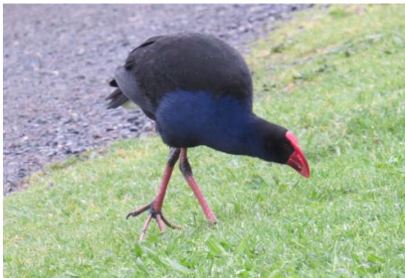
Purple Swamphen.