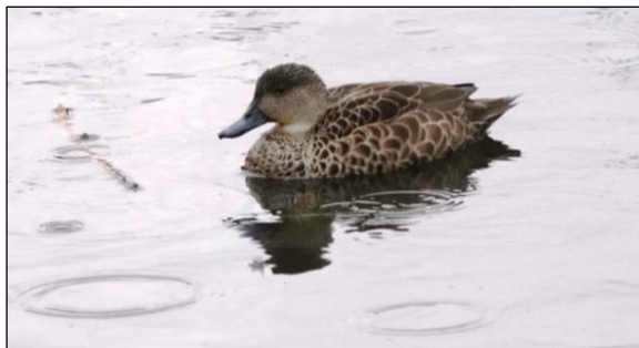
Grey Teal.