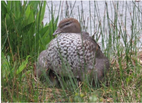
Mother Australian Wood Duck sheltering her young from the rain.