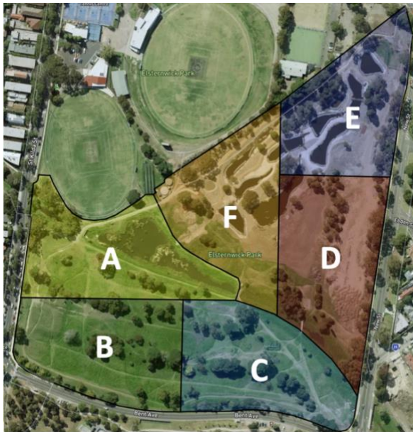
Bird survey areas excluding Area G, Elster Canal