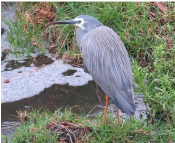
White-faced Heron in breeding plumage.